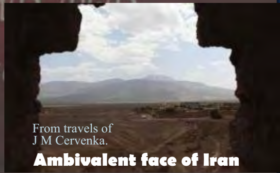
From travels of J M Cervenka.

A data analysis preliminarily validates the new hypothesis that the ratio of dark matter and dark energy to gimmel and TRUE units (Triadic Rotational Units of Equivalence) is ‘contained’ in the atom: Dark matter correlates with gimmel in the atomic nucleus and dark energy with gimmel in electrons.